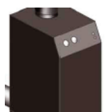
Twin wall insulated flue for pellet stoves and condensing boilers