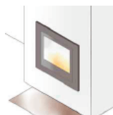
Insert in masonry and timber frame construction