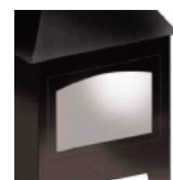
Twin wall insulated flue for log burning stoves